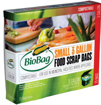
Small 3 Gallon Food Scrap Bags

Look at these test results of food collected in a solid, non-ventilated container versus food waste collected in a UmiMax Bucket using BioBags: